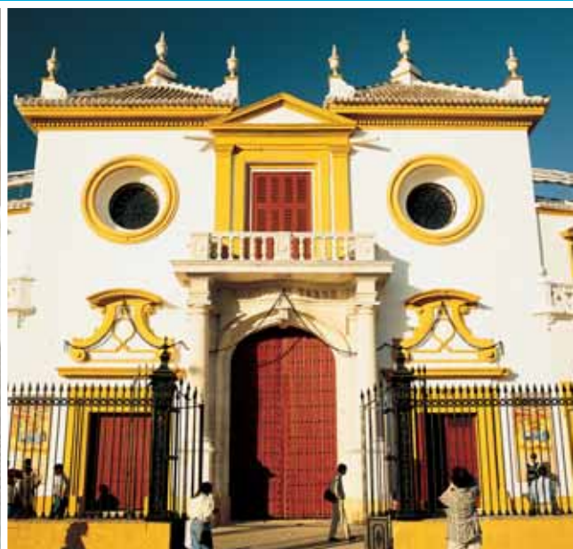
From the Alhambra Palace to the Plaza de la Maestranza, a bullfighting ring in Seville, you are going to take in the best of Spain.

Number of overnight stays in parentheses. This tour may also be reversed.