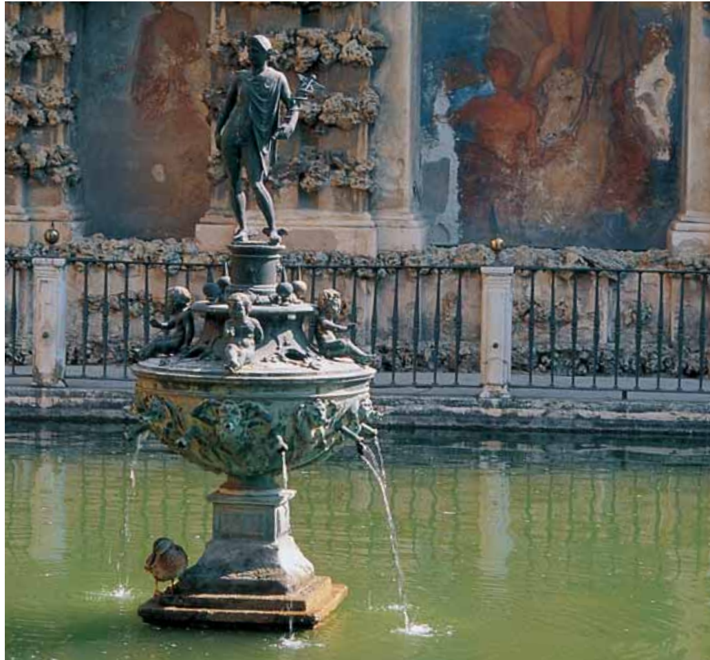
Seville's history of both Roman and Muslim reign is reflected in the city's architecture.

Transfer via AVE train from Córdoba to Madrid • Board Spain's high-speed train, dubbed the AVE—Alta Velocidad Española.